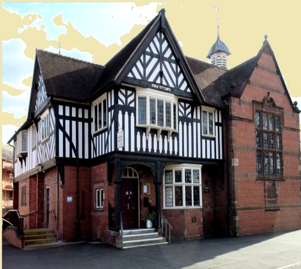
The Barbour Institute, Tattenhall