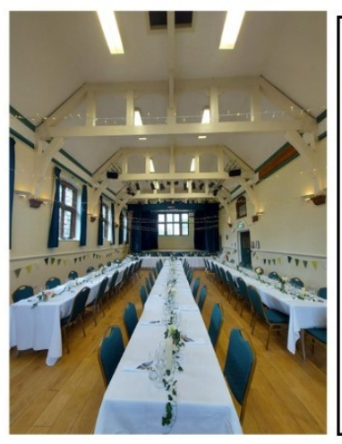
Hatch, Match and Dispatch! Get in touch for details of all our party packages, whether a Christening, Wedding, After Funeral Gathering and everything in between. With all you need, furniture, fully stocked kitchens, including vintage tea sets, music, lights, tech equipment and years of experience.