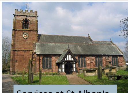
Services at St Alban's