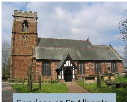
Services at St Alban's

St Alban's will be resuming services as follows