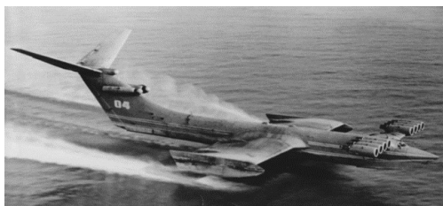
A huge Ekranoplan skims at speed just above the sea. It was about 10 storeys high

Did you know that the Russians built huge tank-carrying 'aircraft' called Ekranoplans which flew at high speed just 18 inches above the water across the Caspian Sea? That was during the Cold War. A small one still survives in a museum in Moscow. They were seen by spy satellites. It was said that they couldn't possibly fly. They did!