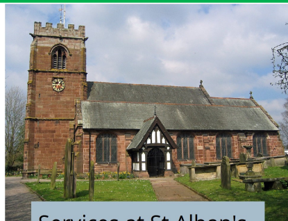
Services at St Alban's

https://u3asites.org.uk/west-cheshire/contact